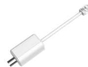
LR1002 ePoE Over Coax Converter