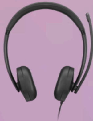
Lenovo Wired VoIP Headset 5000 4XD1R88995

Please click here to view the full list of accessories.