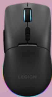
Lenovo Legion M220 Wireless RGB Gaming Mouse GY51U28359