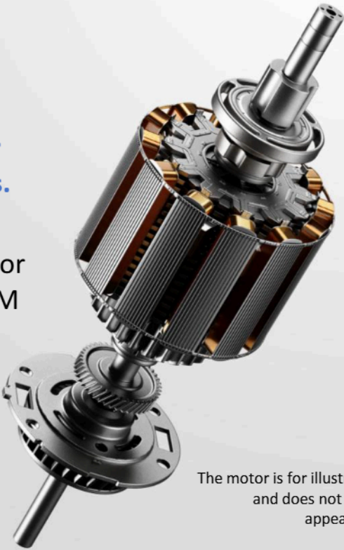
The motor is for illustration purposes only and does not represent the actual appearance and structure.

High-speed, low-noise micro motor with stable operation at 6500 RPM