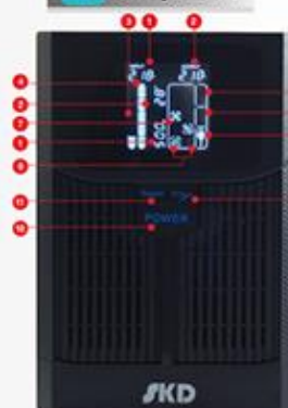
Front panel :