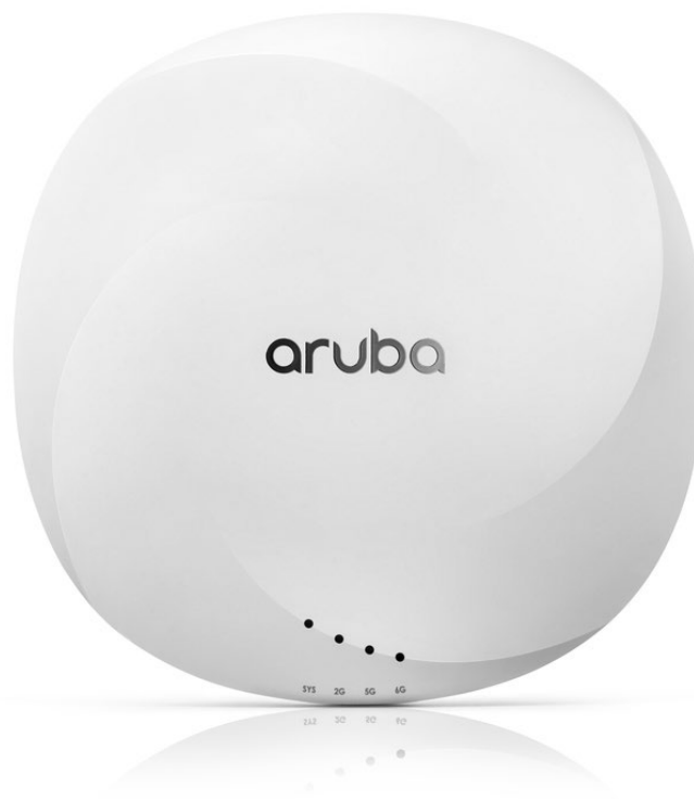
Aruba 630 Series Campus Access Points

For enterprises who need more wireless capacity and wider channels, Aruba 630 Series Campus APs are designed to take advantage of the 6 GHz band via three dedicated radios. By using the 6 GHz band, capacity is more than doubled – so you can meet growing demand due to bandwidth-hungry video, increasing numbers of client and IoT devices and growth in cloud. Unique to Aruba, the Aruba 630 Series includes ultra tri-band filtering and dual 2.5 Gbps ethernet ports to eliminate coverage gaps, provide greater resiliency, and deliver fast, secure connectivity