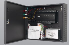
InBio-460 Package B

InBio series is an IP-based biometric access control controller with versatile and flexible functions and it is highly favored in the medium access control management projects with security requirements.