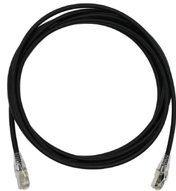
Shielded CAT5E RJ45 to RJ45 Patch Cord,LSZH