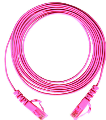
FLAT CAT5E RJ45 to RJ45 Patch Cord