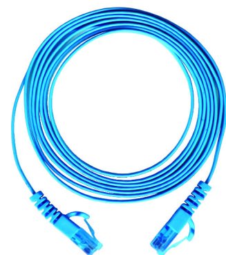
FLAT CAT6 RJ45 to RJ45 Patch Cord